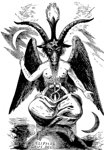
ΒΑΡΦΟΜΕΤ KNIGHTS' TEMPLARS' GOD

The most noted and often used symbol of “As above so below” is that of the demonic Baphomet.